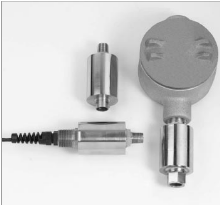
OMEGADYNE Pressure Transmitters Series PX01/PX02 . For complete details request Document #3605 & #3606

Connector Safety Ratings: UL and IEC-348